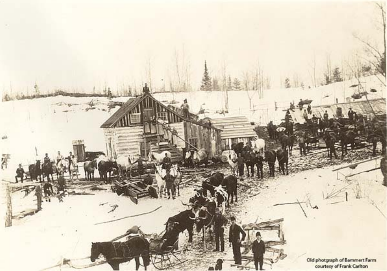
Old photograph of Bammert Farm