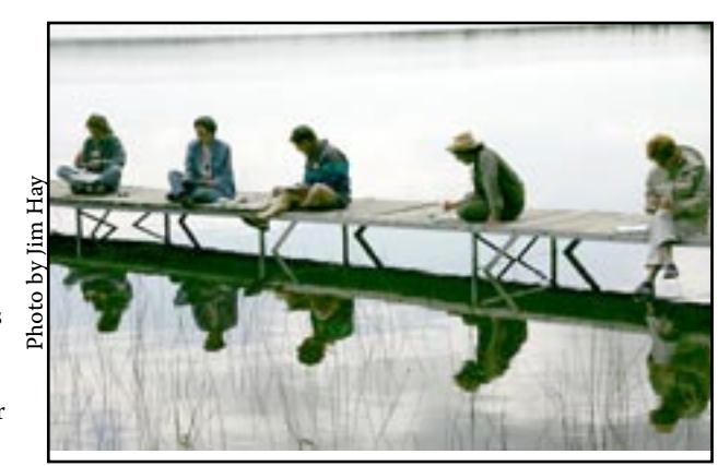
Above, participants in the Reading the Landscape "Water Reflections" field trip to Gratiot Lake work with watercolor. Water Reflections was part of a 6 field trip series focusing on art and natural history.

GLC gatherings, contributing photos, opening your homes for events, cleaning up the shoreline, water monitoring, assisting with programs, reporting on wildlife, and just being there when we needed you!