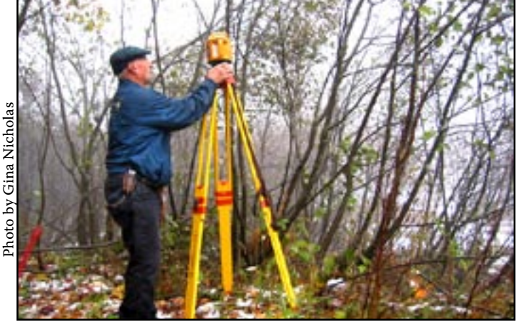
Dick Crane of the Natural Resources Conservation Service surveys Third Dam area of Bammert Farm